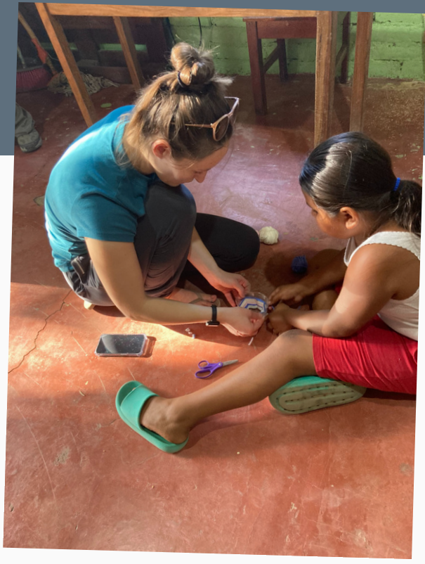
Craft time at VBS