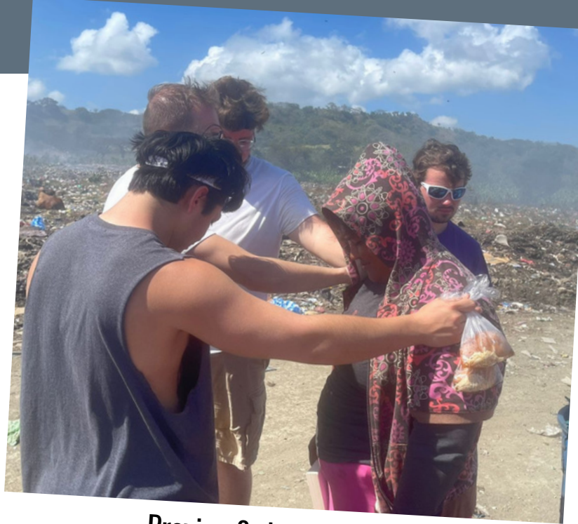
Praying & distributing food to individuals at the dump.